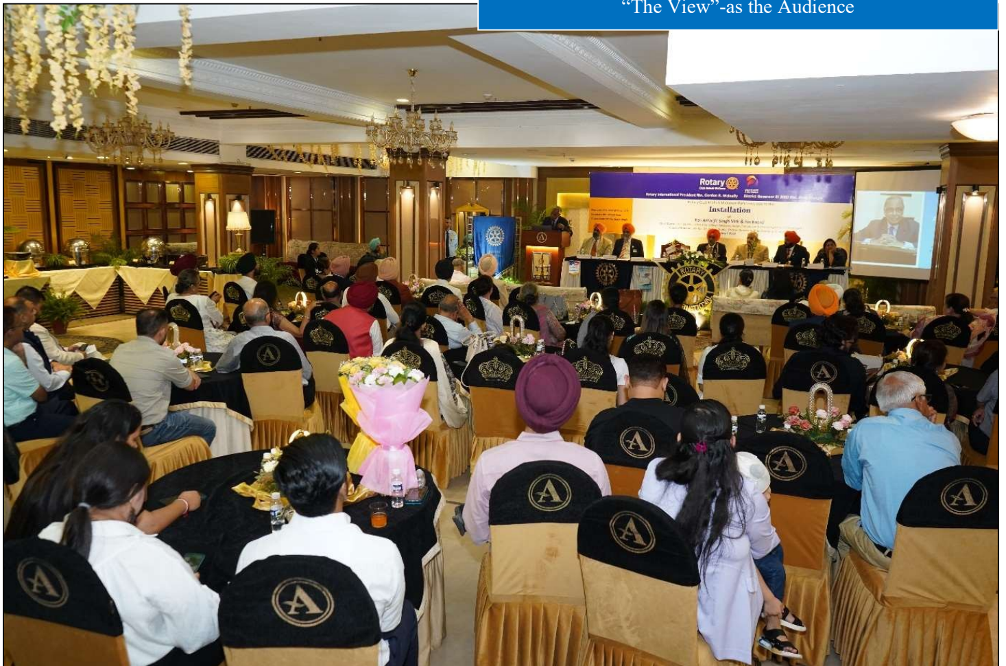
“The View”-as the Audience