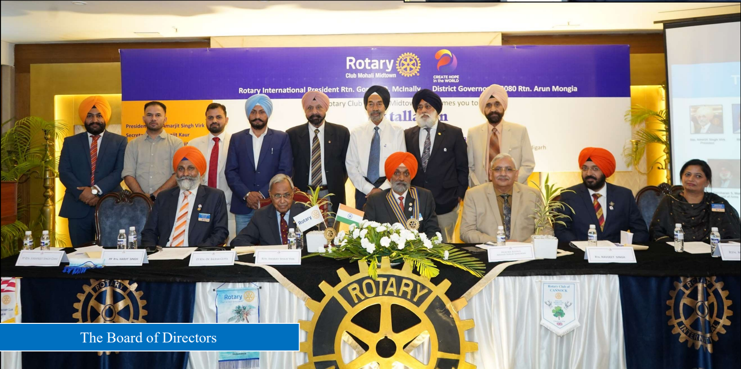
The Board of Directors